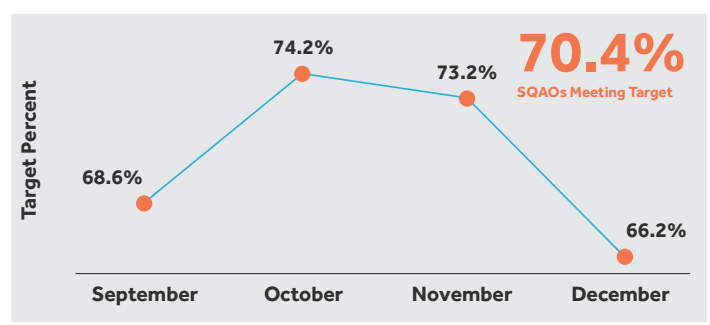
Figure 1: Meeting Target for School Visits (Sept-Dec 2022)