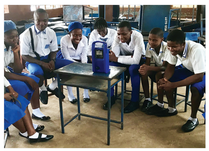
Children listening to the radio at a Girls and Boys Club.

Previously gender segregated Girls Clubs and Boys Clubs had been established for a limited number of children. facilitated by teachers using a guide. However, taken as an extra lesson rather than to engage children, the Clubs had proved ineffective due to teachers lacking skills and motivation to take on the work without incentives. In response, Leh Wi Lan supported MBSSE to establish Girls and Boys Clubs in all secondary schools, providing them with wind up and solarpowered radio players. With male and female hosts guiding the sessions, the Girls and Boys Clubs promote respect, equal participation and discussion around gender-based violence, how to identify it, tackle it and report it, in a friendly, engaging and enjoyable environment. The sessions also introduce topics related to sexual and reproductive health and life skills for adolescents (how to manage emotions and communication).