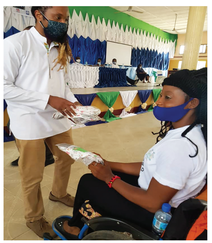
Education Minister of Basic and Senior Secondary Education, David Moinina Sengeh, launching nationwide hygiene kits in October 2020.

David Moinina Sengeh , Minister of Basic and Senior Secondary Education.