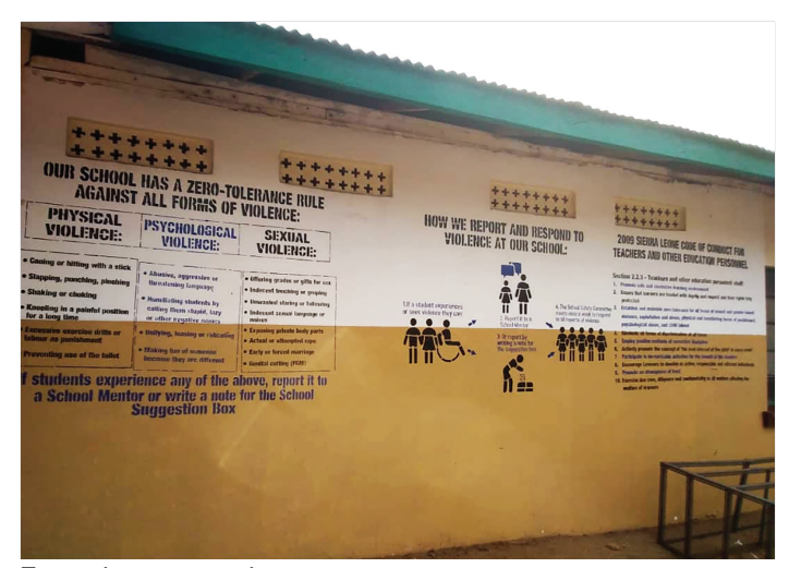
Zero tolerance mural.

Historically, in Sierra Leone's school system there have been many unreported cases of school-related gender based violence due to lack of awareness of the children about their rights and lack of access to reporting systems. The UNICEF GATE project had established School Safety Committees and introduced a reporting system through suggestion boxes in schools. The intervention was successful but needed fine-tuning. Leh Wi Lan's support to MBSSE included strengthening internal monitoring through School Support Officers and District Inclusion Officers, developing a Reducing Violence in Schools Guide, and by introducing Teachers' Learning Circles as a participative approach to learning. School Murals were also painted to depict the roles and rights of school staff and students and, to increase teachers' awareness of their roles and responsibilities, the Teacher Code of Code was disseminated to all secondary schoolteachers.