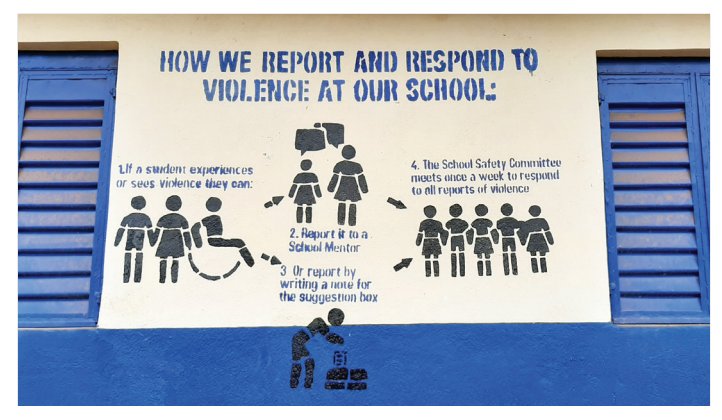
Reporting abuse mural.